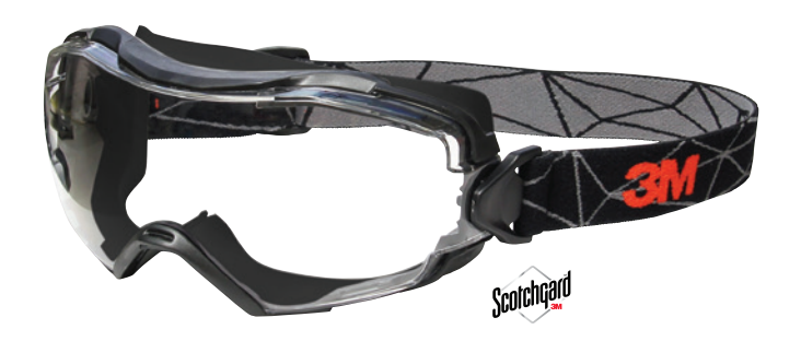
GG6001SGAF-BLK Lens: Clear