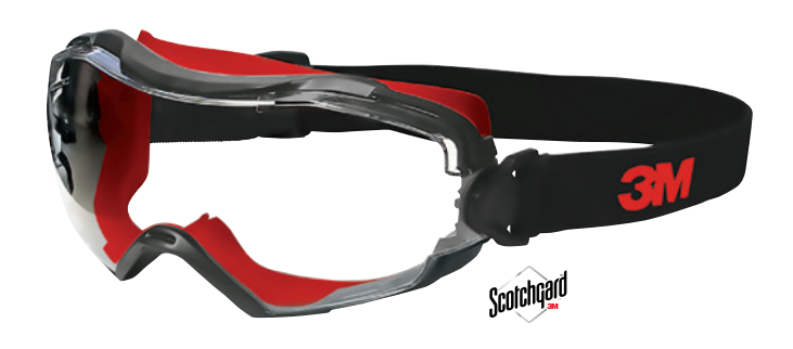
GG6001SGAF-RED Lens: Clear