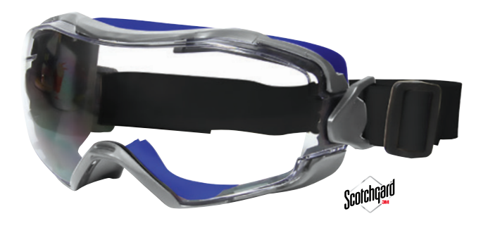
GG6001NSGAF-BLU Lens: Clear