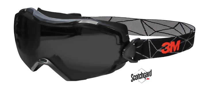
GG6002SGAF-BLK Lens: Gray