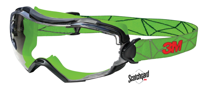
GG6001SGAF-GRN Lens: Clear