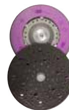
PN51124 / 51125 PN51122 / 51123